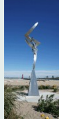
Seven Seven Seven by Bruce Niemi

A detailed description of the sculptures in the Sculpture Walk – HarborPark exhibition was published as an insert to the Sept. 29 edition of the Kenosha News. The Foundation has copies of the insert if interested.